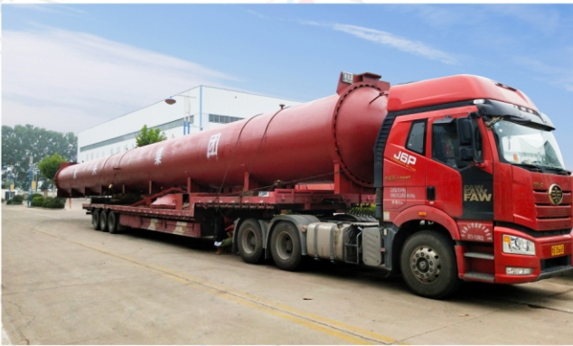
2016.10 河南金邦重工机械贯通式蒸压釜1台FGZCS1.5-2*27.5 2016.10 One set of model FGZCS1.5-2*27.5 through-type autoclave in Henan Jinbang Heavy industry machinery Co.,Ltd