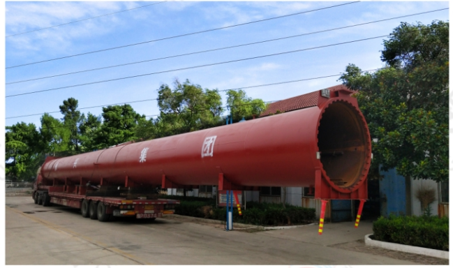
2018.4.16 广西银亿新材料有限公司1台FGZCS1.3-2*27.5 2018.4.16 One set of model FGZCS1.3-2*27.5 autoclave in Guangxi Yinyi New materials Co.,Ltd