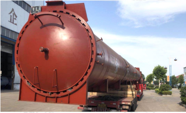
2018.4.25 福建省三明市锦官板业有限公司1台FGZCS-1.3-2*26 2018.4.25 One set of model FGZCS-1.3-2*26 autoclave in Fujian Jingong Wood Plate Industry Co.,Ltd