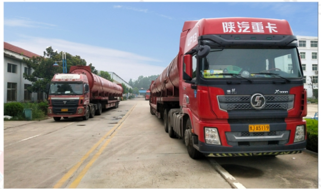
2016.06.15 江西星明建材有限公司2台 FGZCS1.3-2*31.5 2016.06.15 2 sets of model FGZCS1.3-2*31.5 autoclaves in Jiangxi Xingming Construction Materials Co.,Ltd